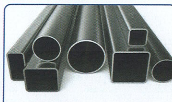
ERW MS PIPES AND GP PIPES